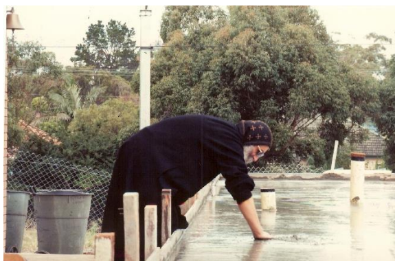
Laying the foundation stone- St Mary, St Bakhomios at Kirrawee

The land we bought was a vacant land and full of bush and weeds and we worked very hard to clean it, then we built the first building, which was a big hall in the bottom, which was used to be the church and at the top was the Sunday school classes and a borrowing library. And at that time, his holiness Pope Shenouda III, sent metropolitan Bishoy to lay the foundation stone with the attendants of the Mayor, Councillors and dignitaries from the government and surrounding churches. We started to pray the holy masses in this new hall, while still not fully finished and do the Sunday school classes in the open area and inside the hall, until we could build the second floor for Sunday school classes.