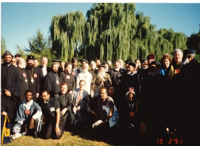
HH Pope Shenouda III with heads of world council of churches in St. Mark Church land Canberra

I established the different services in Canberra like the passion week and the feast of Resurrection, Sunday school and in parallel, I was moving between Sydney and Canberra to build a church for them in the land we took from the government. At that time, there were only 9 families in Canberra and their donations were very little for such a project but with the grace of God, and His great support, I was able to build the church there. The foundation stone was laid by his holiness Pope Shenouda III, in November 1989 and the church was finished by the end of 1990. His holiness Pope Shenouda III consecrated the alter of the church in January 1991. At that time there was the 'world council of churches' assembling in Canberra and this made the consecration of the church be attended by the Prime Minister of Australia. Many ministers and chief personalities of the Federal government and all the heads of different churches around the world, who were there attending the world council of churches, in which his holiness Pope Shenouda III was chosen to be one of the 7 members of the committee, heading the world council of churches.