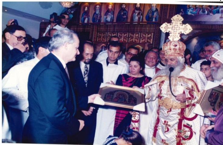
Pope Shenouda III presents to Hon. Phillip Rudock