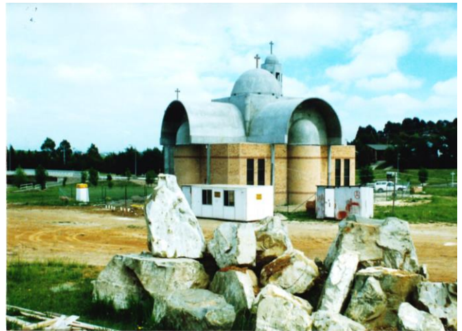
St Mark Church Canberra final building stage