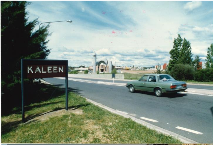
St Mark Church Canberra after completion

Canberra (this land is in a corner of 2 main streets in Kaleen and it is exactly in front of the main shopping centre of Kaleen) .