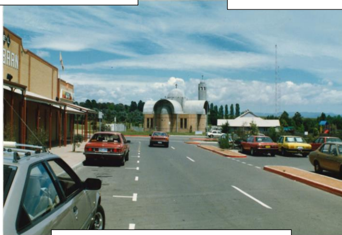
St Mark Church Canberra completed

I established the different services in Canberra like the passion week and the feast of Resurrection, Sunday school and in parallel, I was moving between Sydney and Canberra to build a church for them in the land we took from the government. At that time, there were only 9 families in Canberra and their donations were very little for such a project but with the grace of God, and His great support, I was able to build the church there. The foundation stone was laid by his holiness Pope Shenouda III, in November 1989 and the church was finished by the end of 1990. His holiness Pope Shenouda III consecrated the alter of the church in January 1991. At that time there was the 'world council of churches' assembling in Canberra and this made the consecration of the church be attended by the Prime Minister of Australia. Many ministers and chief personalities of the Federal government and all the heads of different churches around the world, who were there attending the world council of churches, in which his holiness Pope Shenouda III was chosen to be one of the 7 members of the committee, heading the world council of churches.