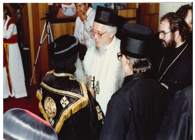
HH Pope Shenouda III with heads of world council of churches in St. Mark Church land Canberra