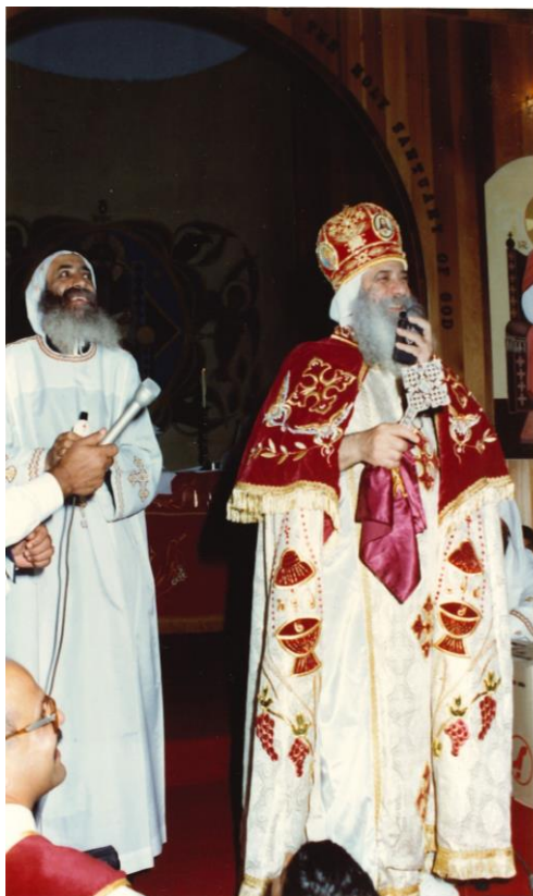
After Consecration – St. Mark Church Canberra

In the prayer of consecration, his holiness Pope Shenouda III, was so happy and he asked the ladies to make this special sound that they do in weddings, to highlight the great occasion of consecrating the Church altar and Baptism and ordained many deacons on that day. It was an occasion of great memory to the church.